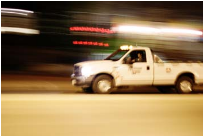
50mm, f1.4, 1/10, ISO 800

For some photographers the winter months, with the quick onset of night, can seem like a sentence to indoor photography and/or editing old photos and prints. The good news is that this fate is avoidable as night offers many unique photographic opportunities. For example, the lack of light can be ideal to practice panning using slow shutter speeds.