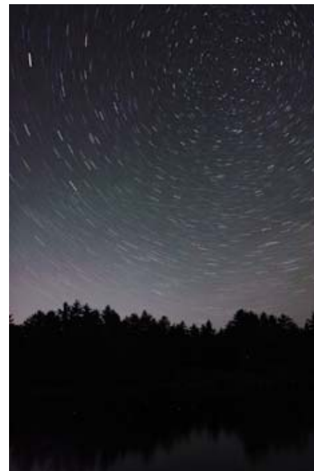
17mm, f/4, 14 min, ISO 100

In the photo below the star trails are of course caused by the rotation of the earth. A rough estimate of