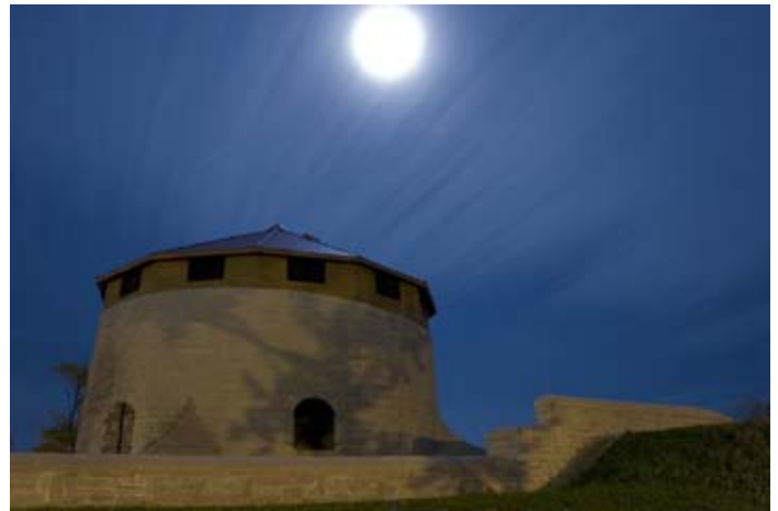
17mm, f/13, 242 sec, ISO 100

On nights before or after the full moon the exposure time will increase. When there is no moon the